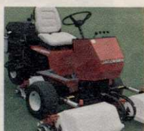
Jacobsen Turf Equipment