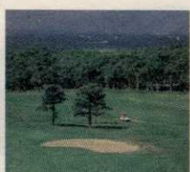
Golf Course Financing