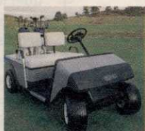
E-Z-GO Golf Cars