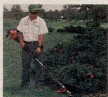
Homelite Power Equipment

For down to earth golf related recommendations, and the complete financing packages you'll need to implement them, make contact with TFC... The First Choice