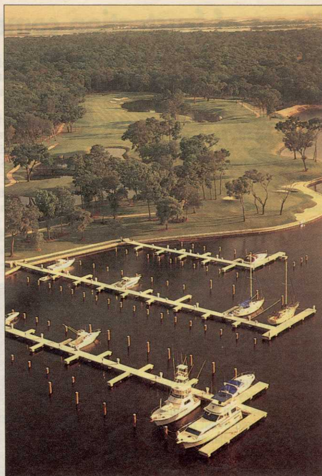
Continued on page 49 GolfCorp recently took over management of Royal GC at Queens Harbor.

January marked the beginning of GolfCorp's ambitious three-year, 6-8-10 acquisition program. The Dallas-based company plans to buy six courses in 1994, eight in 1995 and 10 in 1996. That will nearly double the 32 golf properties the company currently owns or operates.