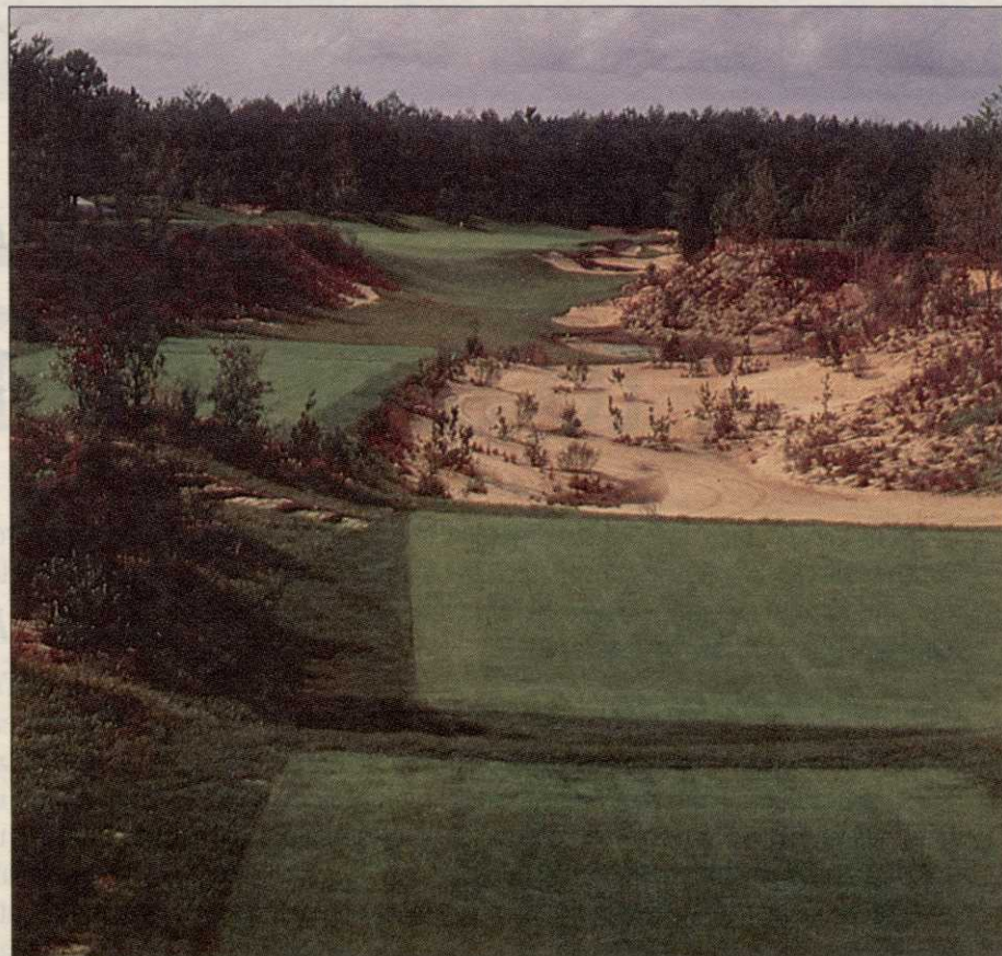
World Woods used a mass discount program to attract business.