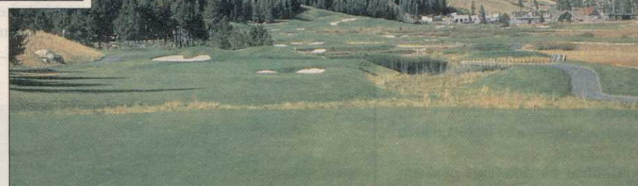
After being used as a parking lot for the 1960 Winter Olympics, Olympic Valley was noticeably improved by Squaw Creek Golf Course.

In other results, the poll illustrated the scarcity of large-scale public golf developers despite the high percentage of public facilities among openings the last few years. No single developer received more than a handful of votes —