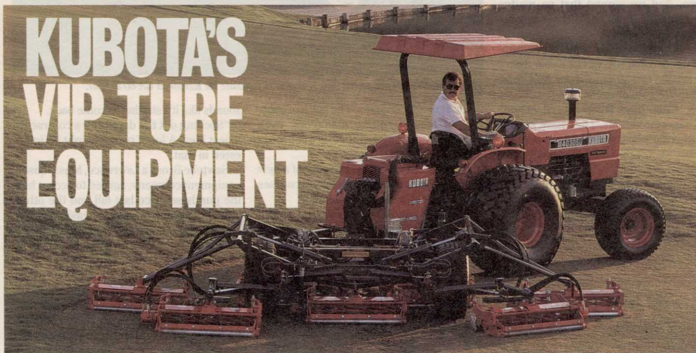
M4030SU with 5-gang Verti-Reel for high production mowing.

Or are we willing to make the sacrifices that must be made by supporting the people who have the skills that allow us to meet society's demands?