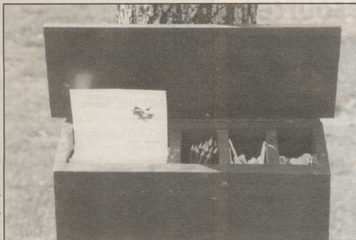
Scorecard boxes are cheap, easy to make, and helpful to the golfers.