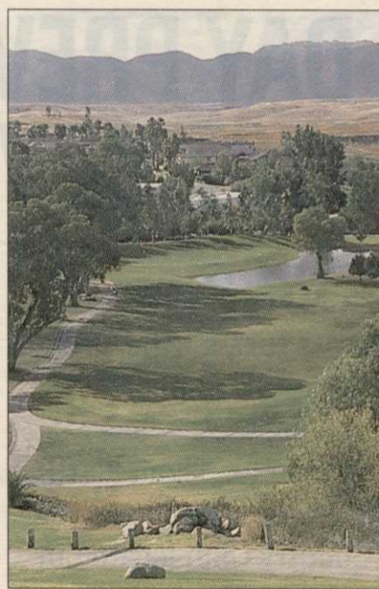
No. 3 at Rancho California, soon to be owned/managed by the Southern Calif. Golf Association.