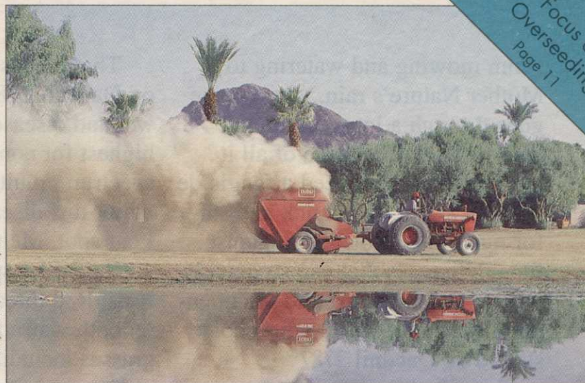
After the dormant bermudagrass is scalped at LaQuinta (Calif.) Country Club, maintenance crews vacuum the debris in preparation for overseeding.