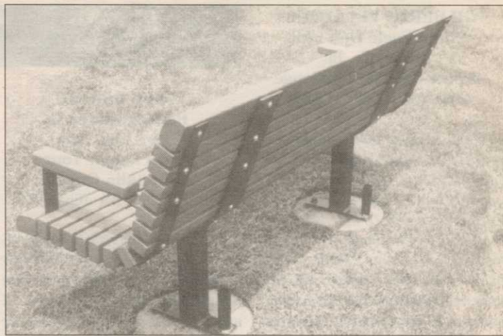
Try stealing this! A Schlippert-secured bench at Commonwealth National

What works in Horsham should work anywhere, he believes.