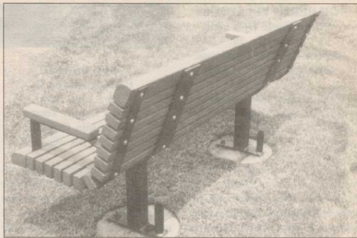
Try stealing this! A Schlippert-secured bench at Commonwealth National

What works in Horsham should work anywhere, he believes.