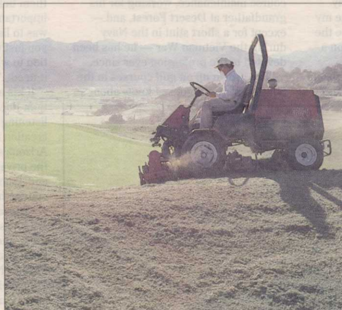
A member of the grounds crew at Bighorn Golf Course in Palm Desert, Calif., scalps dormant Bermudagrass in preparation for overseeding.