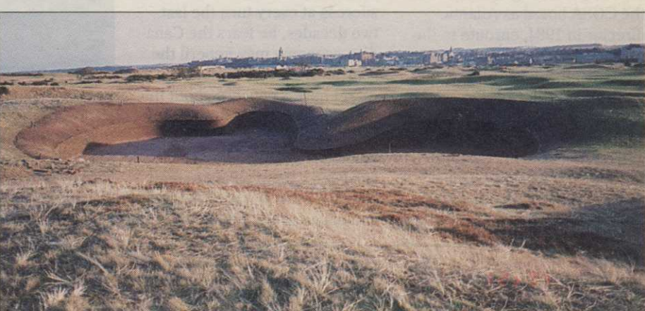
In preparation for the 124th British Open Championship next year, St. Andrews is refurbishing its famed sod-wall bunkers — the Hell Bunker on the 14th hole, above, and Shell Bunker on the 7th, below — worn by the wind and golfers' sand blasts.