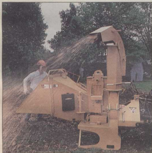
SPECIAL REPORT ON CHIPPERS & SWEEPERS, PAGE 16

Developers now have access to $20 million in bonds to build on public land in Tennessee ..... 21