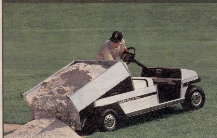
Carryall II Plus

All of our Carryall Turf Utility Vehicles work hard around the clock, rain or shine, day in and day out. They can't help it; they're made that way.