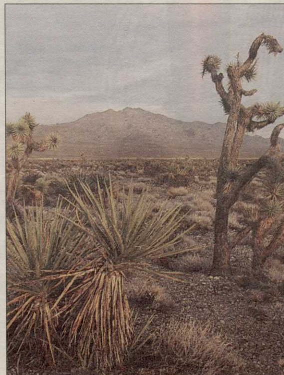
The Paiute Indian Reservation will be home to a 72-hole, Landmark-developed golf and gambling resort.