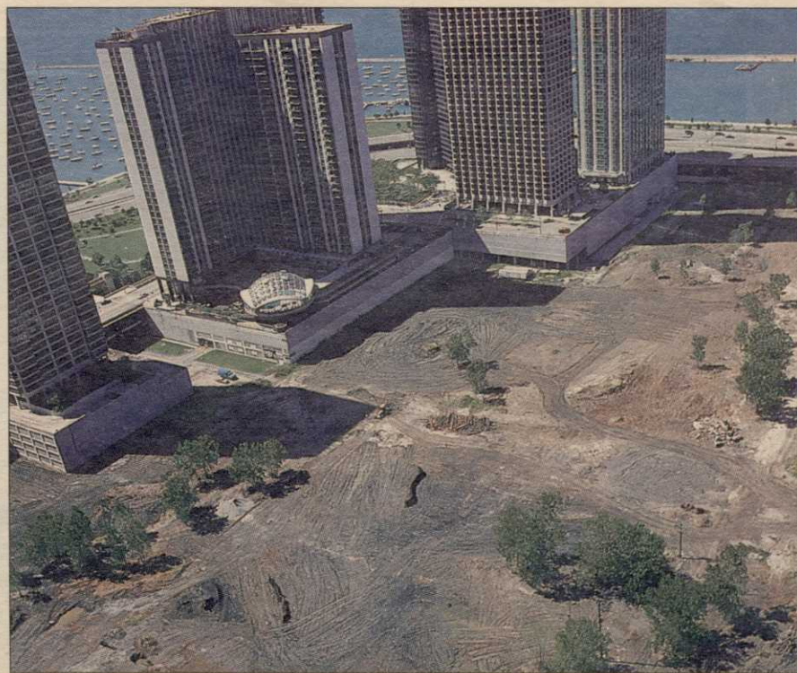
Lake Michigan and skyscrapers frame the Family Dye's par-3 and practice-range project in Chicago.