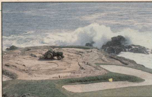
Pebble Beach Golf Links • Pebble Beach, CA