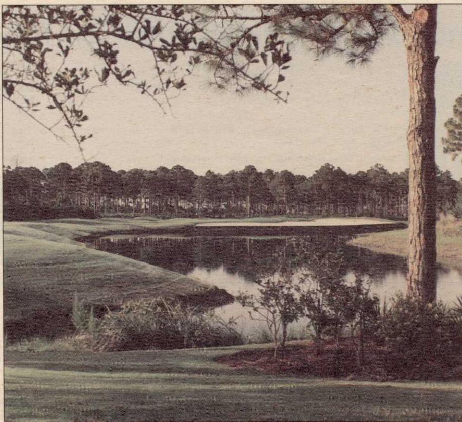
The 5th hole at Riverwood Golf Club is a par-3 that plays to a large, oblong green with a hump in the middle. It plays from 97 to 153 yards over five tees.

Superintendent Scott Hamm, who came to Riverwood during construction from Cape Coral Country Club, is facing the challenge of overcoming high salt content in the course's irrigation water. He is using an injection system to neutralize the salt's pH and leach the salts through the soil, and is applying gypsum and potassium every 45 days.