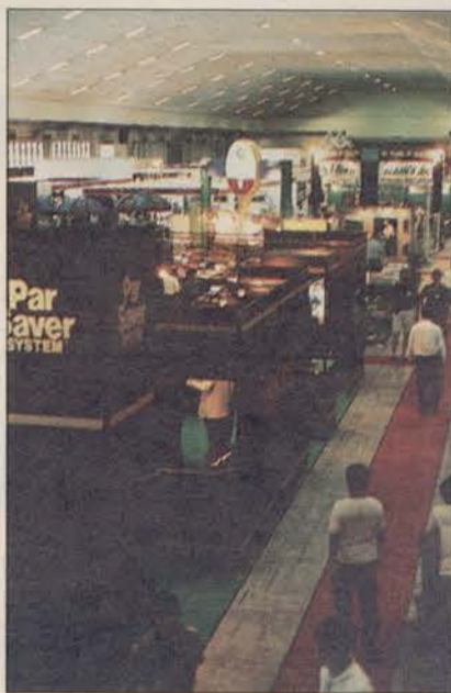
More than 200 companies exhibited at Golf Asia '93, held in late March in Singapore. Jon Huntsman (below), the United States Ambassador to this island nation, officially opened the four-day exhibition.