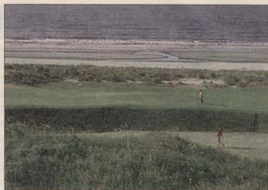
The Ocean Course at Kiawah Island is among the former Landmark Land Co. properties that will be on the RTC auction block in mid-July. Membership groups, large corporations and wealthy individuals are all expected to make bids on the legendary golf course properties.

The six properties have a book value of $740 million and include some of the world's premier championship golf courses and resorts. They are Mission Hills Country Club, PGA West, LaQuinta Hotel Golf & Tennis Club and Carmel Valley Ranch, all in California; Palm