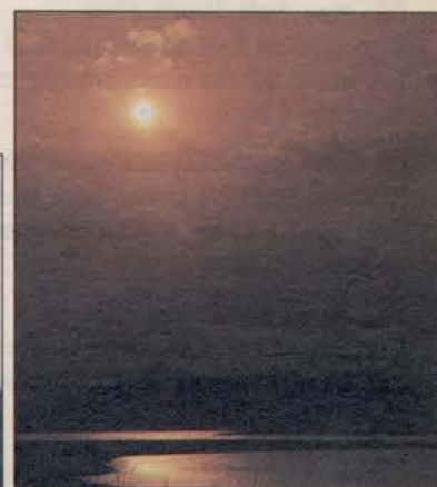
The sun sets beautifully on Vietnam, including the 9th hole, left, at King's Island near Hanoi is nestled in the forest.

guest lodge and 50 corporate villas for long-term rental. Ground was broken on the first 18 holes in February. The first nine should open before the close of 1993, said Earhart.