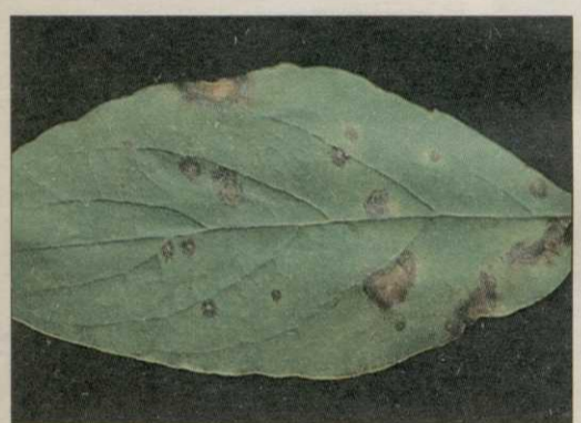
DOGWOODS, ASH AT RISK Dogwood anthracnose (as shown in the above leaf) is devastating America's dogwood trees from the Atlantic to the Mississippi. Meanwhile, Ash Yellows has stricken the nation's supply of green and white ash. See page 13.

One superintendent has beaten a poa annua problem by overseeding with bentgrass ..... 54