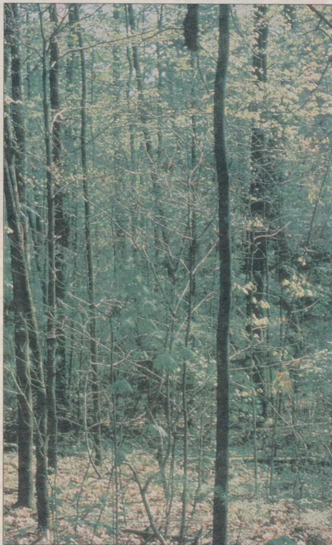
Dogwood anthracnose causes major, and obvious, growth problems to dogwood trees, starting on the leaves and spreading to branches and trunks.