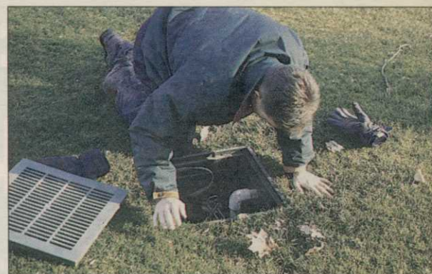
Burning Tree CC had a drainage problem just off the first fairway (left) until the author installed a small sump pump. The results have been gratifying and, most important, drip dry.