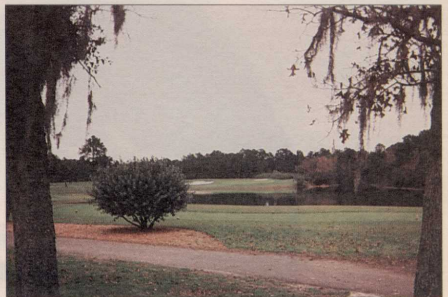
The third hole at The Country Club at Silver Spring Shores in Sarasota, Fla.