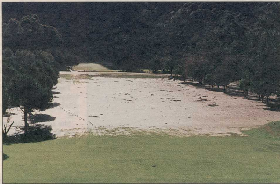
The first hole at Aliso Creek Golf Course, a nine-hole track in South Laguna Beach, Calif. The creek overflowed its banks during the heavy rains of January and was closed for two weeks.

Torrential rains present a different sort of water problem west of Rockies