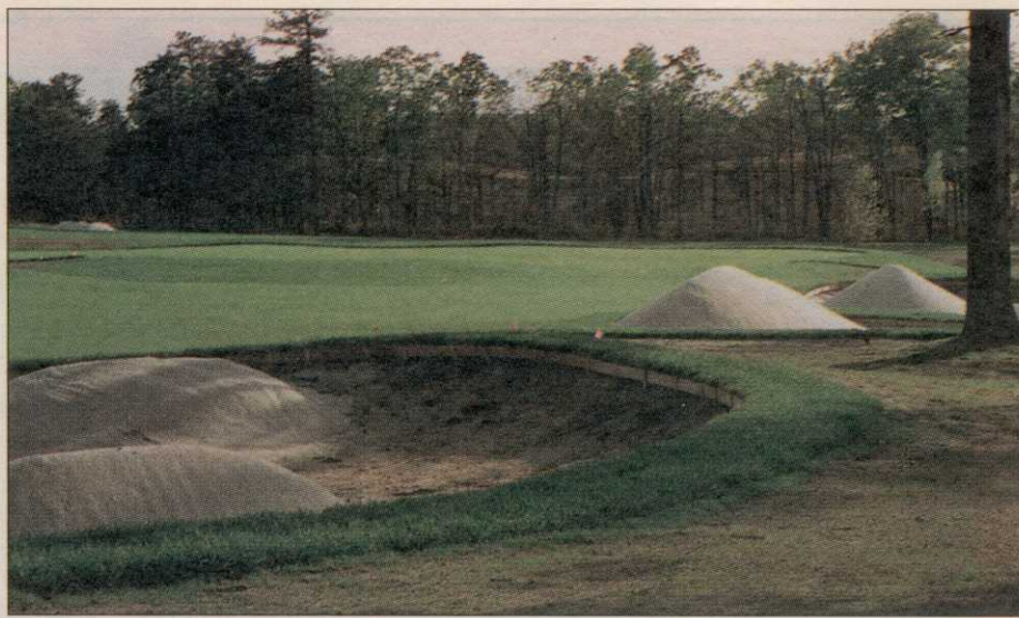
Playability is the most important aspect of bunker sand. Color is second. Sand can be too white.