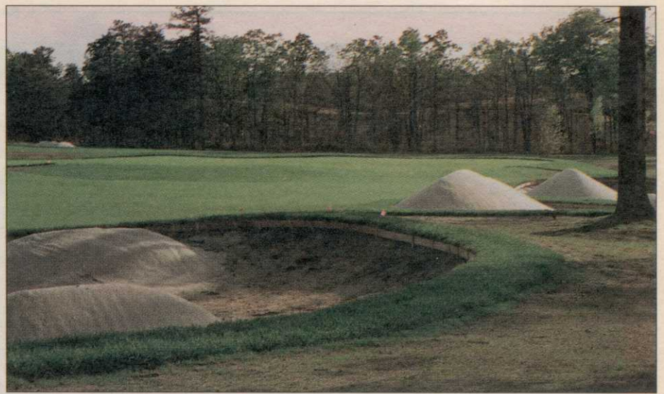
Playability is the most important aspect of bunker sand. Color is second. Sand can be too white.