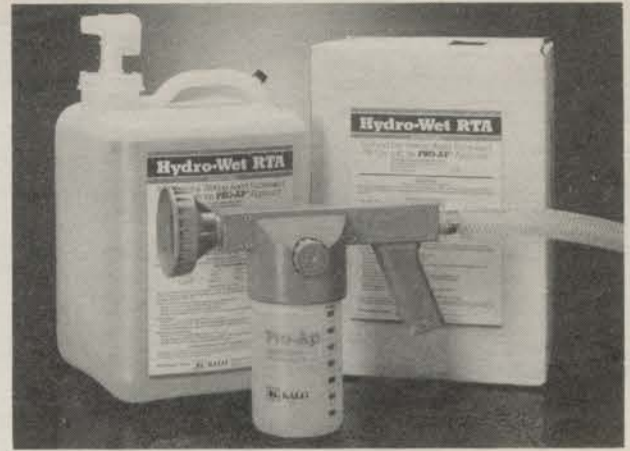
Pro-Ap and Hydro-Wet RTA offer a better way to treat localized dry spot.