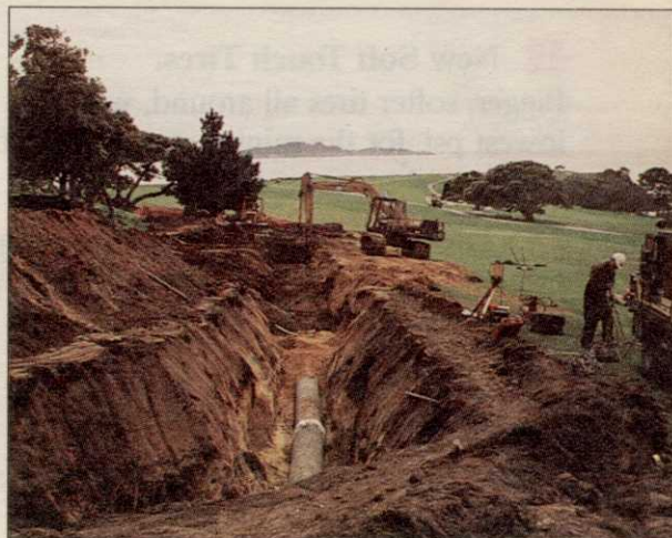
Effluent pipe is laid along the 14th fairway at Pebble Beach Golf Links.