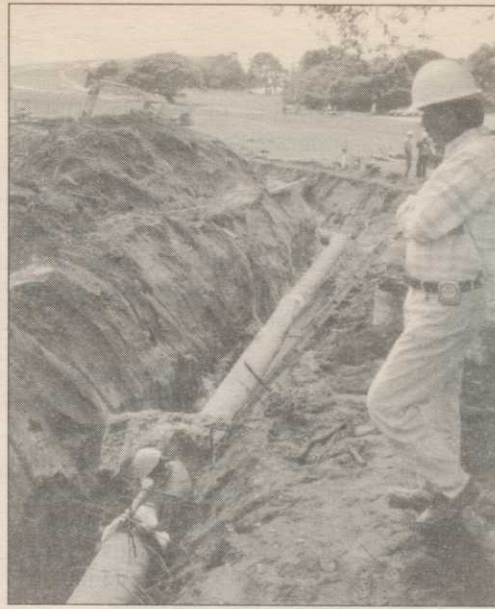
A construction crew digs the trench to carry effluent water to irrigate Pebble Beach Golf Links. A 50-foot swath was cut to lay pipe across holes 14, 15 and 16.

With that type of corporate backing, the Pebble Beach Co. has agreed to guarantee repayment of the COPs and to pay annual operating expenses of the project should expenses exceed the revenues generated from the sale of reclaimed water.