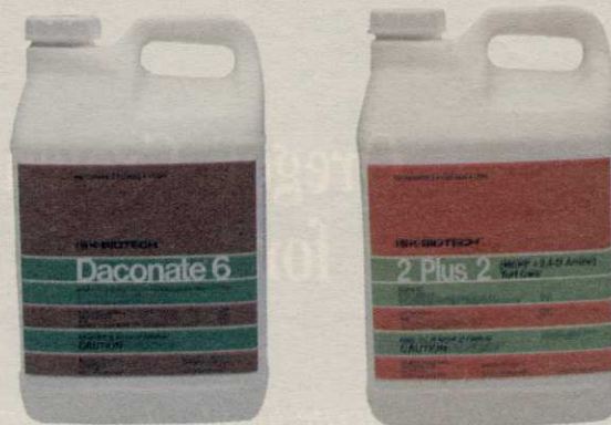
Always follow label directions carefully when using turf chemicals. Daconate ® 6 is a registered trademark of ISK Biotech Corporation.

ISK Biotech Corporation, 5966 Heisley Road, P.O. Box 8000, Mentor, OH 44061-8000