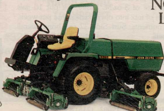
CIRCLE #107/BOOTH #2612