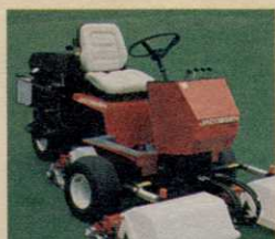
Jacobsen Turf Equipment