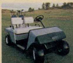
E-Z-GO Golf Cars

Don't waste strokes out in the rough. We can structure a finance package to fit your needs. For the most complete golf-related financing programs, TFC is the best approach to the green.