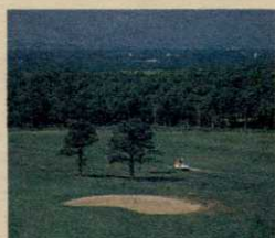
Golf Course Financing