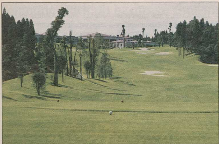
The view from the tee at the par-4 18th hole of Regent Miyazaki in south Japan.