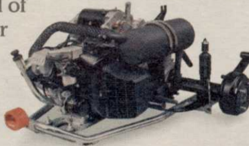
Carryall's Powerful 4-Cycle Gasoline Power Train.