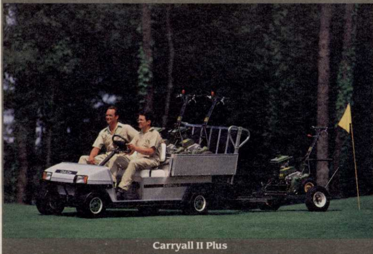
Carryall II Plus