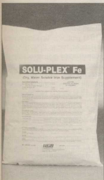
Solu-plex Fe from R.G.B.