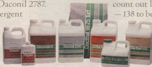
Always follow label directions carefully when using turf chemicals.

When it comes to turf and ornamental care, count on the Turf Care Pros. And count out labeled diseases and weeds — 138 to be exact.