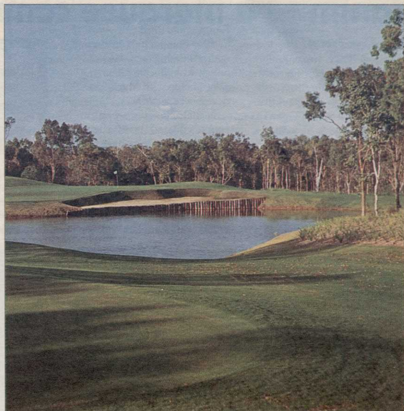
Turtle Bay's 140-meter, par-3 4th hole is a challenge of accuracy.