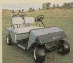
E-Z-GO Golf Cars

Don't waste strokes out in the rough. We can structure a finance package to fit your needs. For the most complete golf-related financing programs, TFC is the best approach to the green.