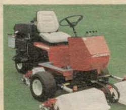
Jacobsen Turf Equipment