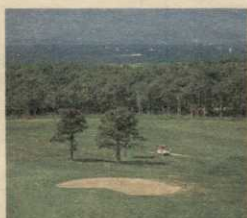
Golf Course Financing