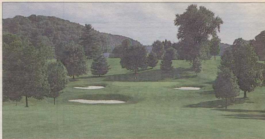
Lancaster (Ohio) Country Club's new 12th hole.