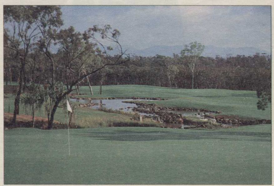
DEVELOPMENT DOWN UNDER Asian-Pacific development is booming, as evidenced by no. 9 at the new Graham/Panks course, Turtle Point GC, in Repulse Bay, Queensland, Australia. For a report Golf Asia '93, see page 45.