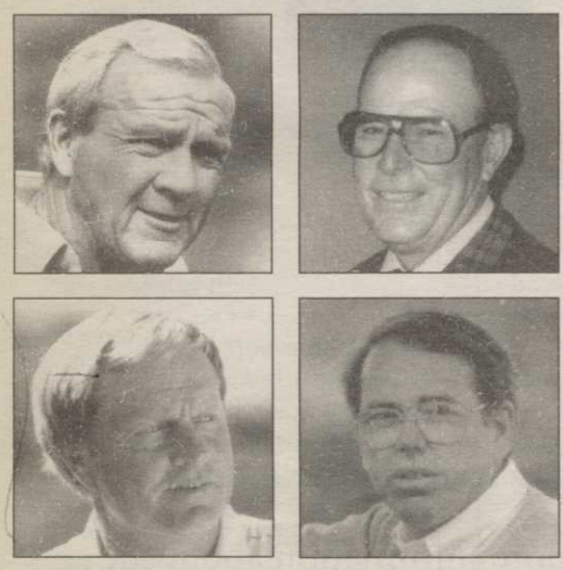
HEAD TO HEAD When the biggest names in golf course architecture design courses in the same vicinity, where do people choose to pay their greens fees? For answers, see page 37.

New York superintendents embrace speedy and cost-effective turfgrass labwork performed by Monroe County Extension office ..... 13