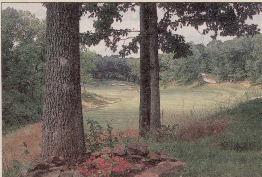
The 11th hole shows a fraction of the beauty of AnnBriar Golf Course.