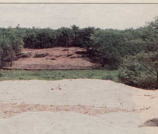
Geoffrey Cornish has built nearly a score of golf courses in Maine. His new nine at Bath (Maine) Country Club will feature this dogleg on the par-5 15th hole.

GCN: You've been designing golf courses over half a century.