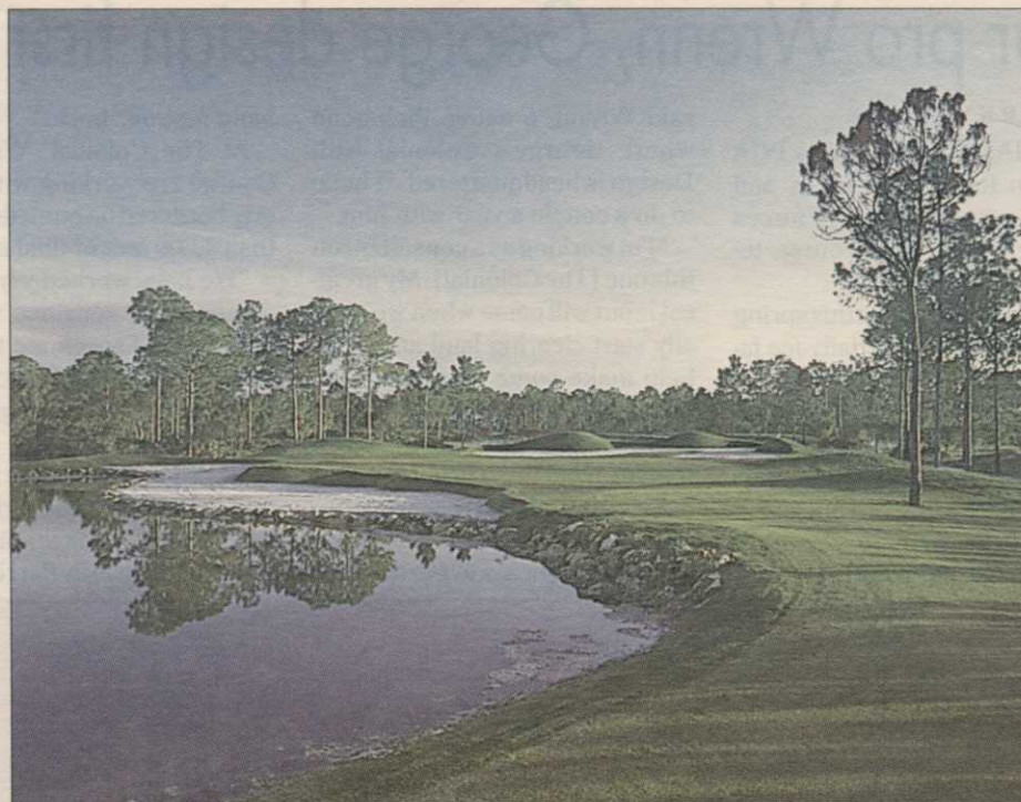
Grey Oaks Country Club's par-3 6th hole.

The clubhouse was designed by Diedrich Architects and Associates, with interiors by Image Design, Inc.