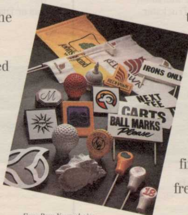
Fore-Par: Your choice for distinctive golf course accessories. Personalized, non-personalized and custom

So equip your golf course with the finest accessories available. Call for your free Fore-Par catalog today!