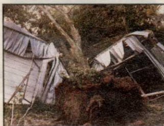
This was the post-Andrew scene at Oakbourne Country Club in Lafayette, La. The maintenance shed (inset) was totaled.