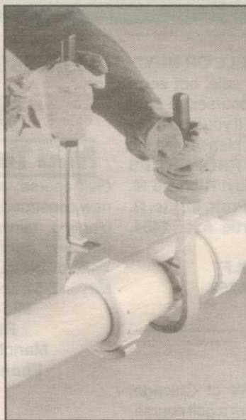
The new nub wrench from Stamos