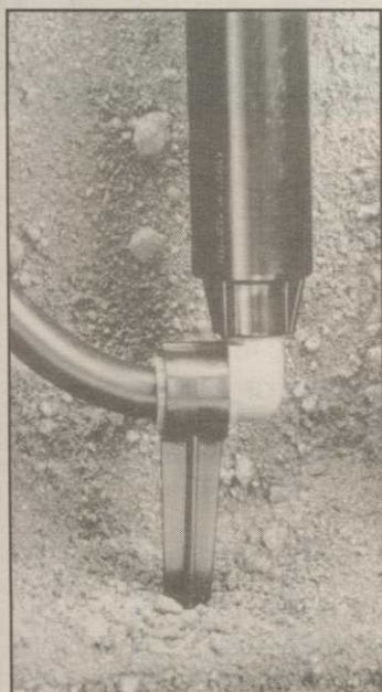
The E-Z Stake lock from Olson