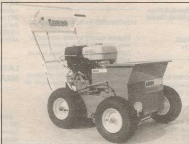
The new Renovator-20 from Lesco