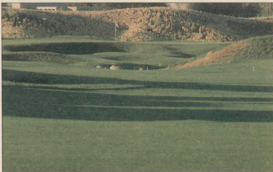
The 7th hole at Stonecreek Golf Club