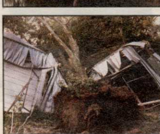
This was the post-Andrew scene at Oakbourne Country Club in Lafayette, La. The maintenance shed (inset) was totaled.