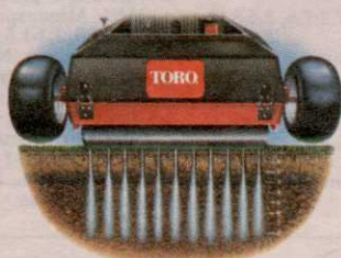
The HydroJect® 3000. Can penetrate up to 20" for improved water infiltration with additional shots.

worked as partners with three generations of superintendents. To provide you