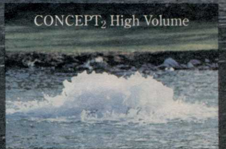
CONCEPT 2 High Volume