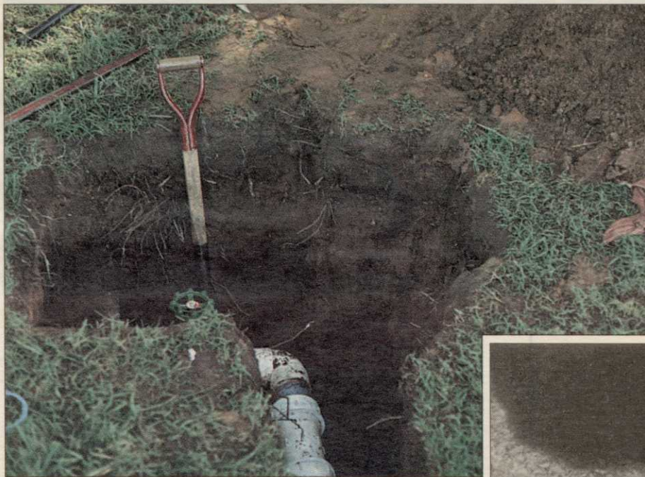
Though the problem has been discovered at Brook Hollow Golf Club, the work has just begun. In photo above, one can see what 35 years of silt build-up can do to sandy soil. In photo at right, the ill-effects can be seen in the root zone of this seven-year-old green.

The culprit, all agreed, was the water source. When the city rechanneled the river in the late 1950s, the section of the river at the course was turned into a drainage sump. The situation worsened