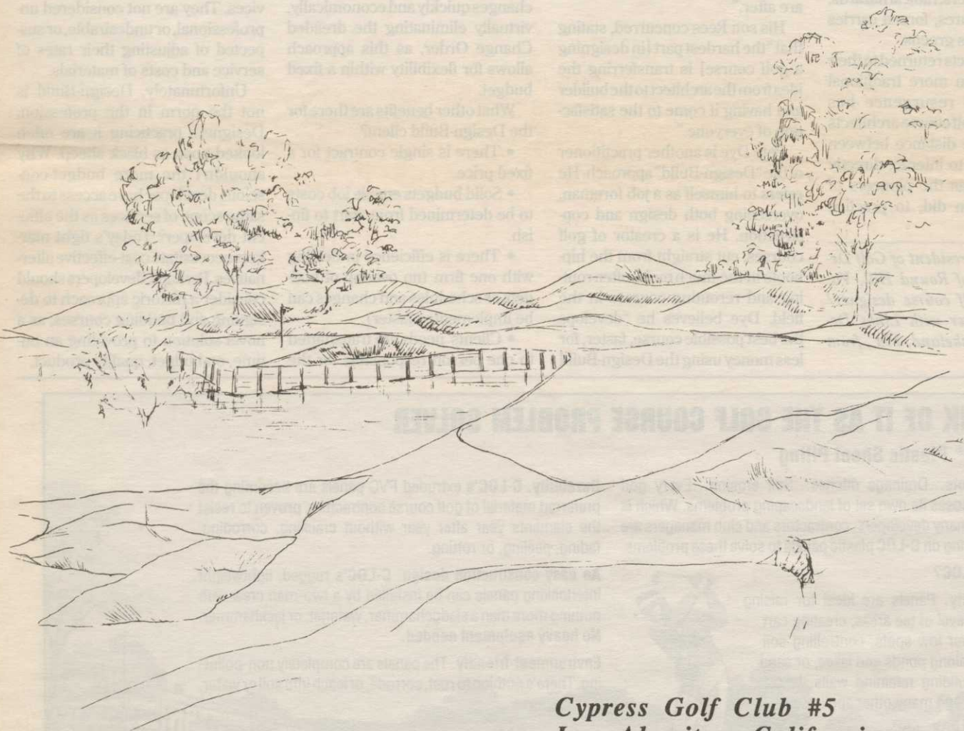
Cypress Golf Club #5 Los Alamitos, California Illustration by Elsie Dye

designing and building golf courses around the world