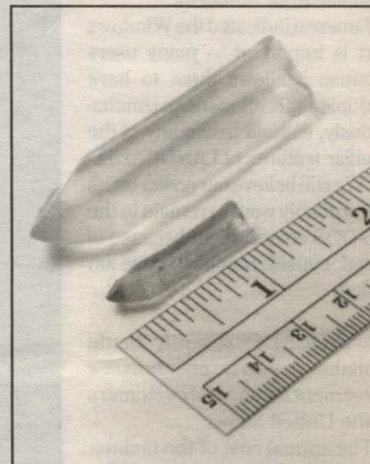
Polymer crystals start out small — but after absorbing several hundred times their weight in water, they grow accordingly.