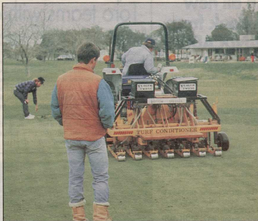
Polymer application over a wide area requires heavy, specialized equipment, and has been described as "surface disruptive."

Coosaw Creek's milestone pump is a 2500 GPM, VFD system featuring PSI's new PumpWatch software package. PumpWatch is now standard on all PSI stations with PLC logic. The VFD drive, as well as all electrical components, will be American-made Allen-Bradley.