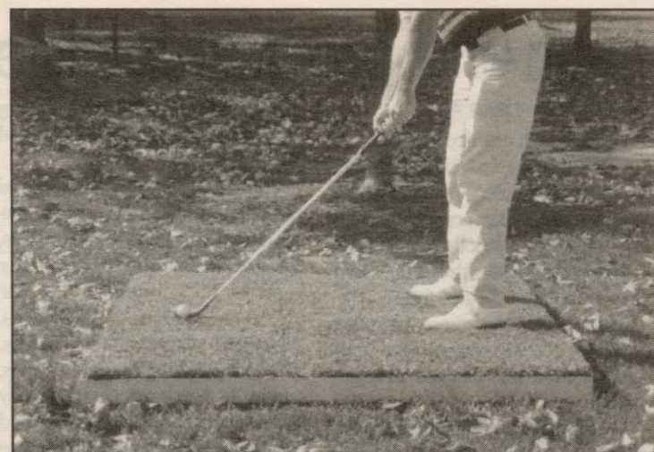
The Porta Turf natural tee platform.

Hollrock Engineering, manufacturers and suppliers of a complete line of equipment for all range operations, recently introduced the golf ball delivery system.