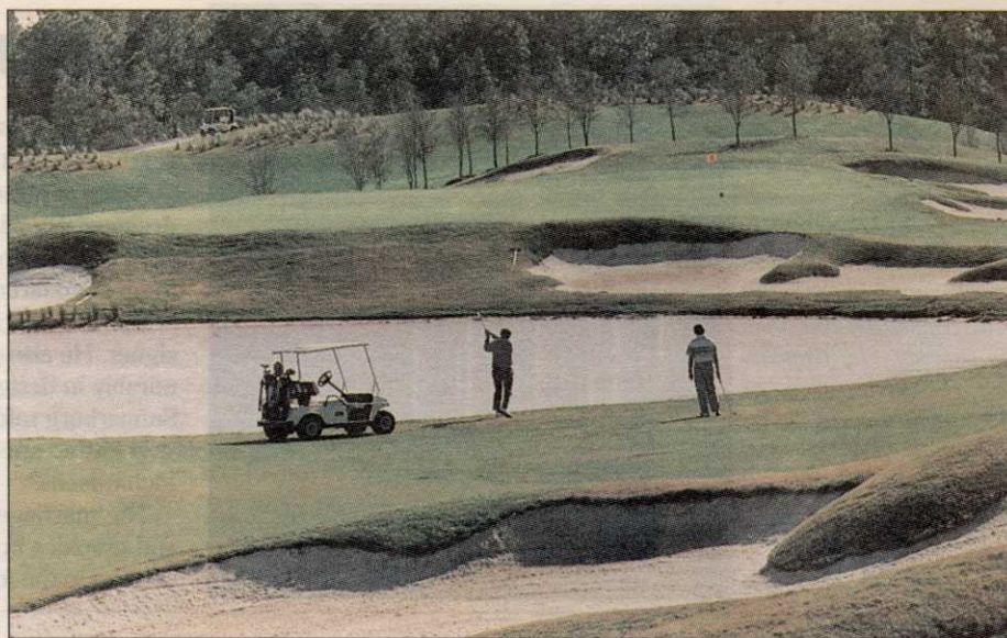
Tom Fazio's Osprey Ridge course offers plenty of challenges.

"Both golf courses have exceeded our expectations."